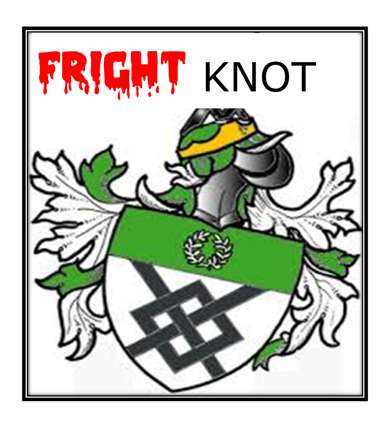
Fourth Quarter ♦ October – January A.S. LIV 2019