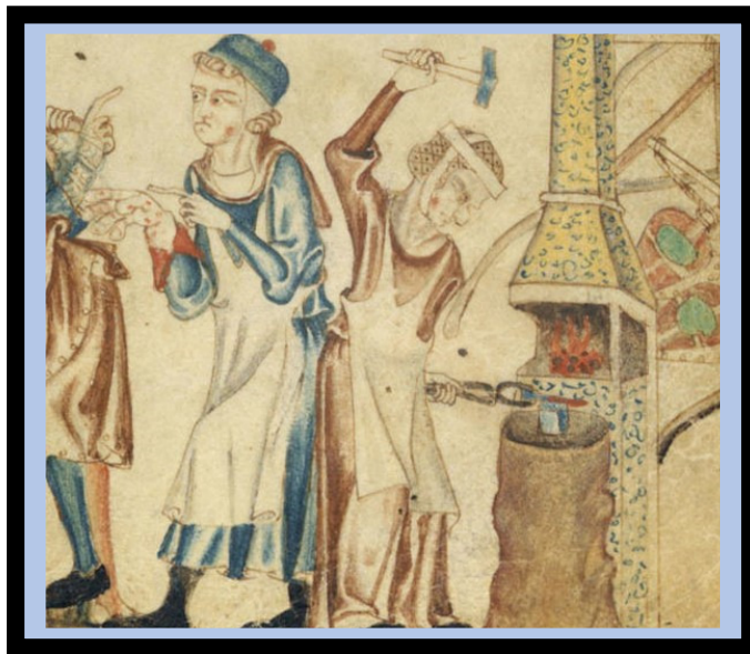
Image from the Holkham Bible Picture Book

(Chroniclers Note: This was published exactly as received with formatting and spelling intact.)