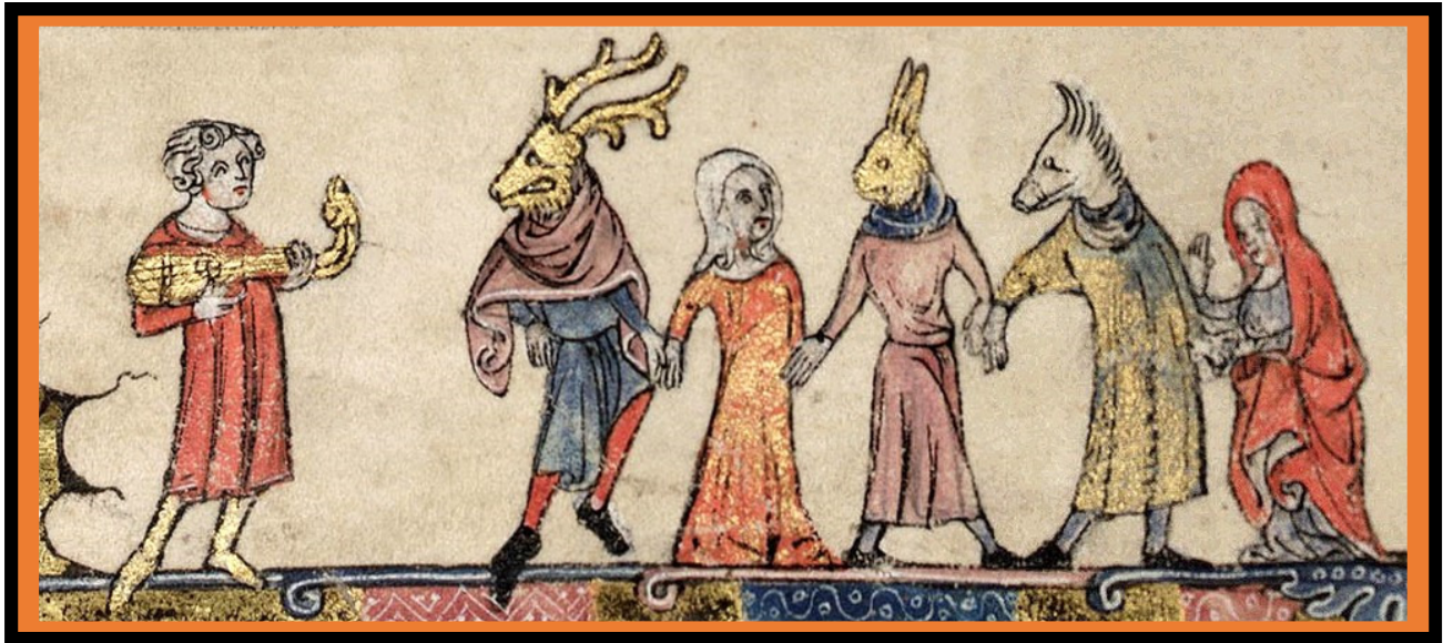
Mummers Bodleian library ms. Bodl. 264, fol 21 v.