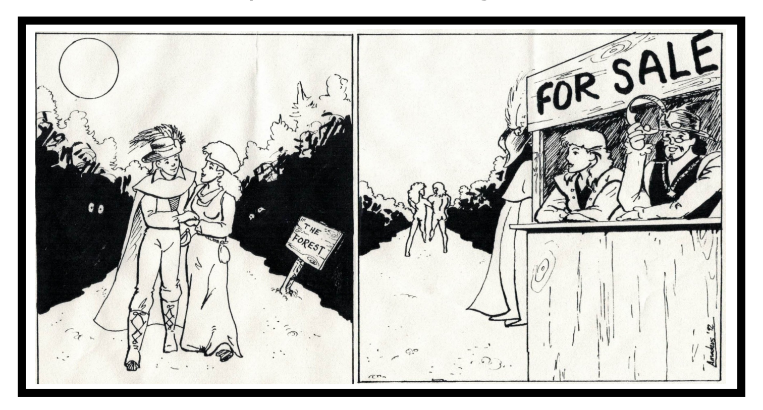
40 years of "Theater Not Drama"