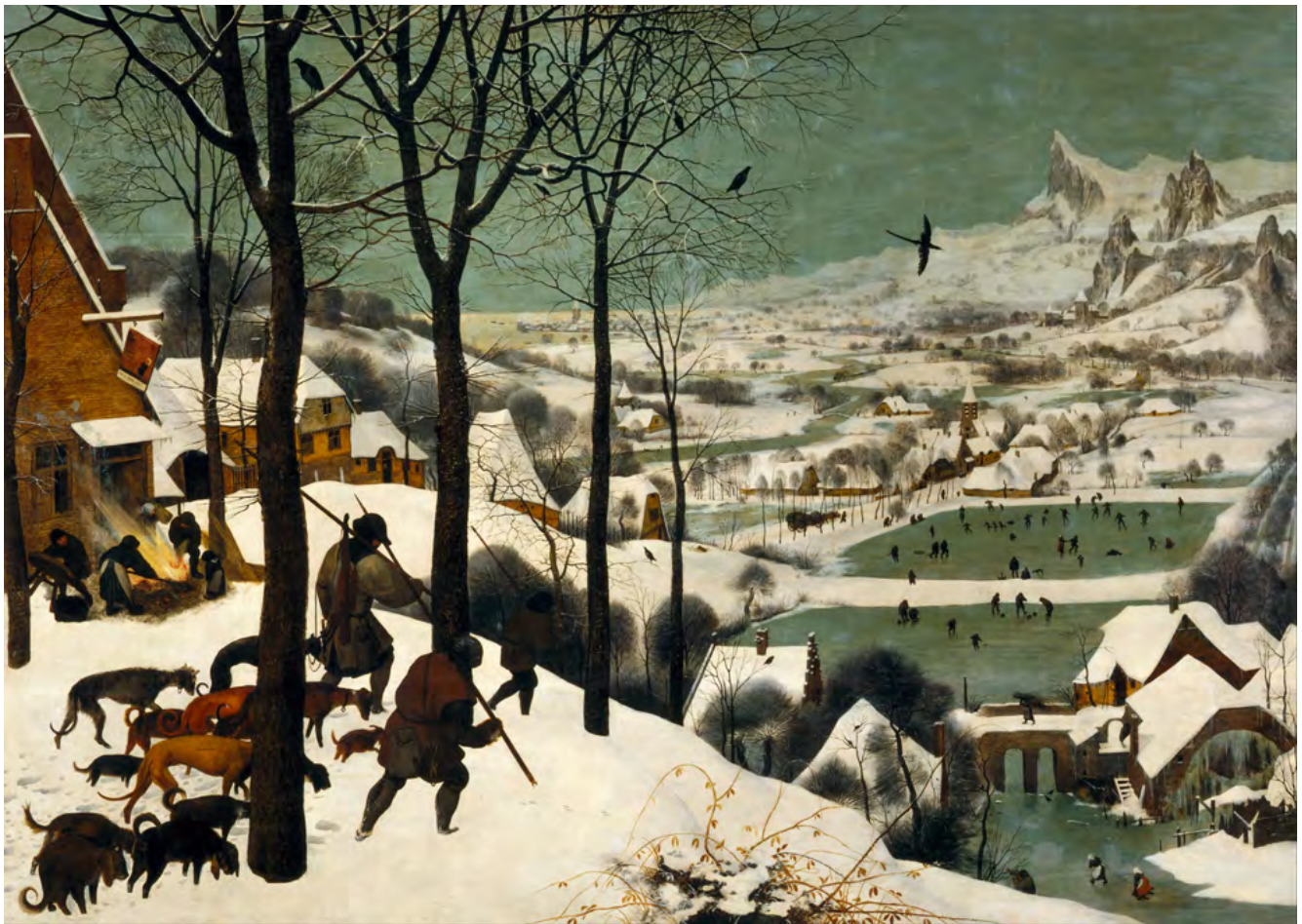
Hunters in the Snow Pieter Bruegel the Elder, 1565

1st Quarter: January - March A.S. LI - 2017