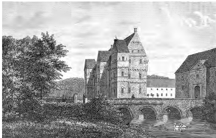
Borreby Castle, near the town of Skælskør in the south-west corner of the island of Zealand, Denmark.