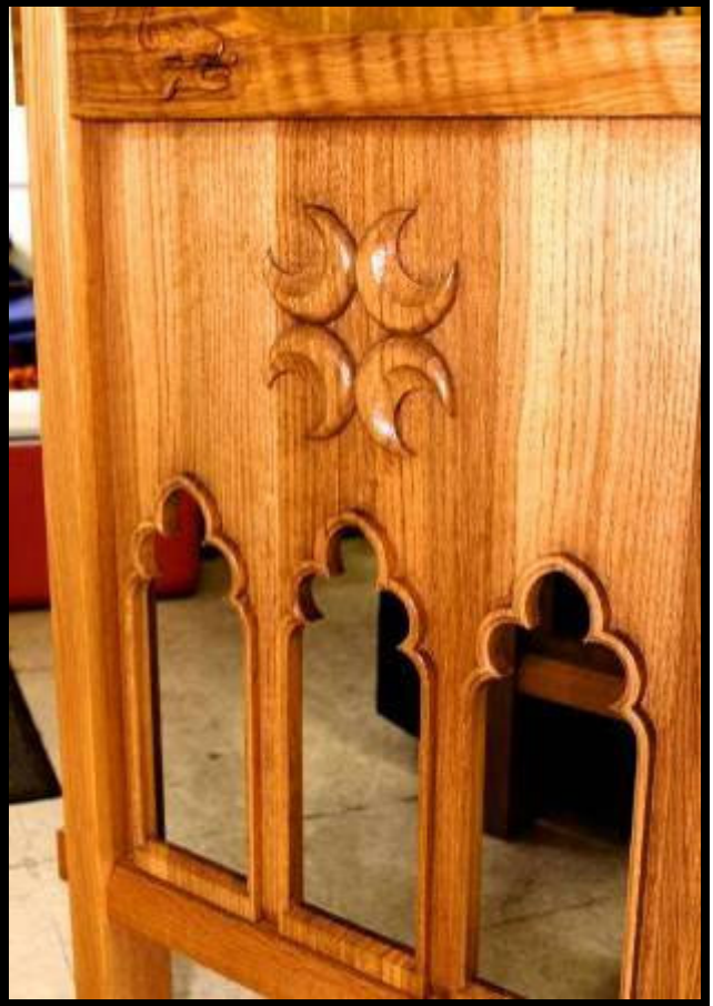
More of the incredible detail work – and yes, they break down too!