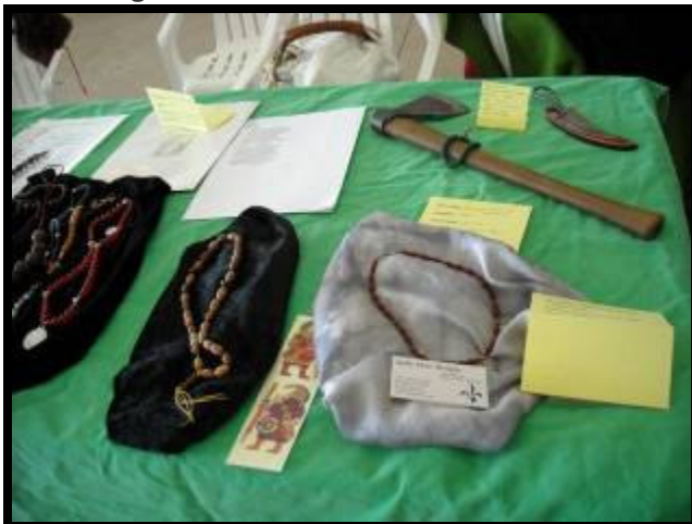
Angels table at the Artisan's Showcase -