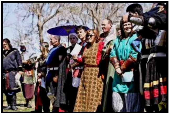
... and the Chivalry