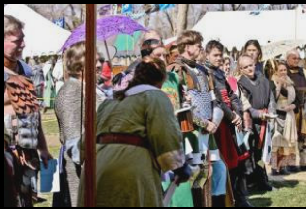
The Challengers ...