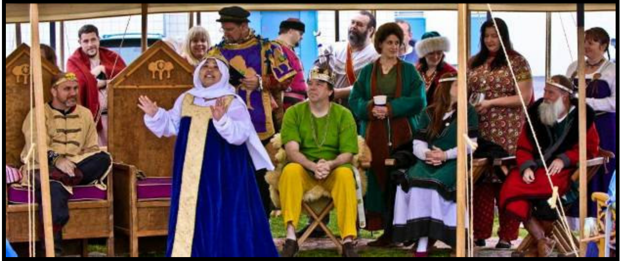
Baroness Collette explains it all for you