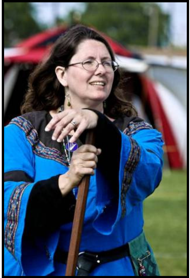
THL Tezar marshals for Rapier