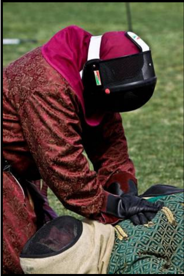
The Barons of the day joke around!