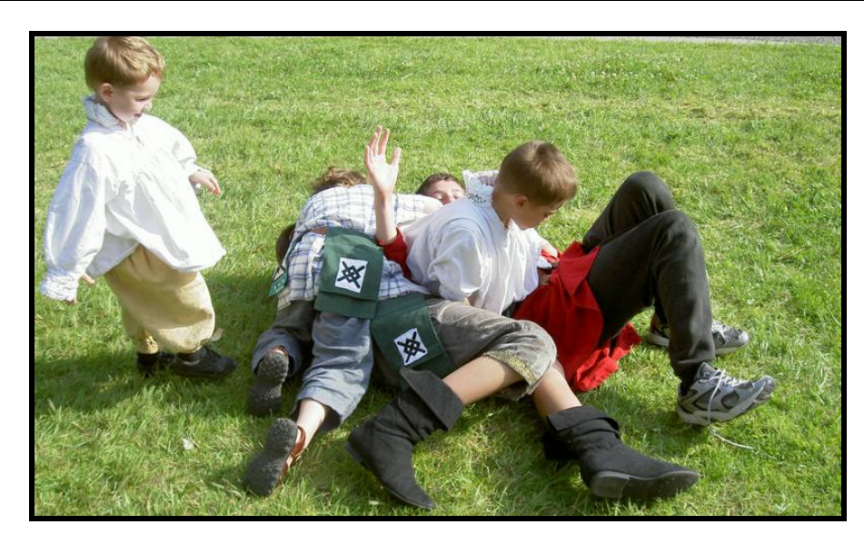
Children romp at Altavia's Anniversary! More Pics on pages 5-7