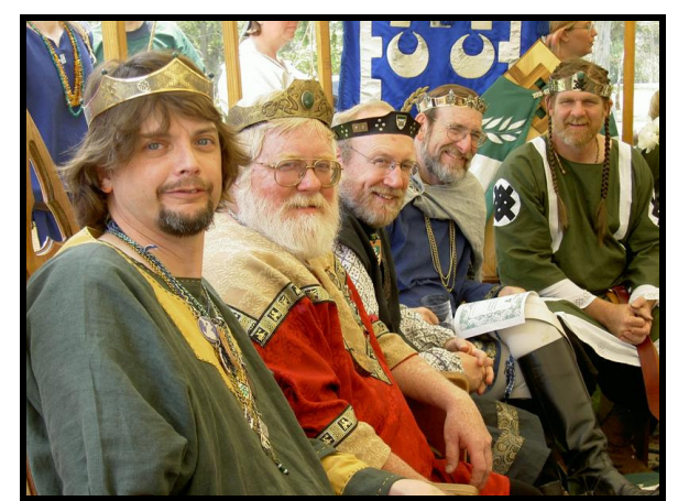
Altavia's Five Landed Barons...