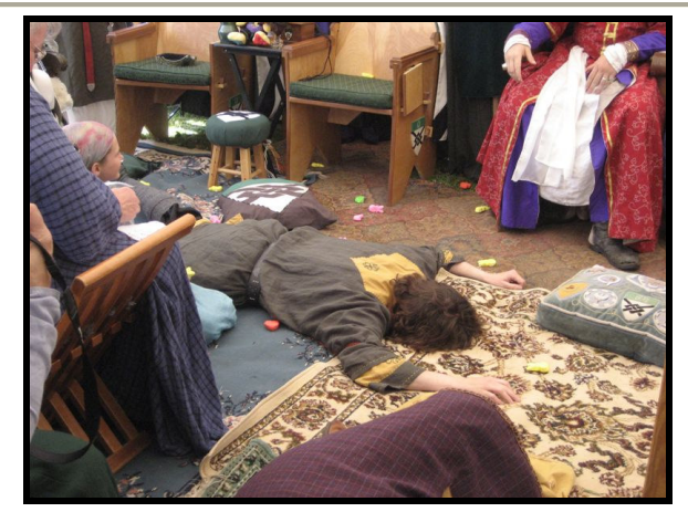
DEATH BY PEEPS!!!