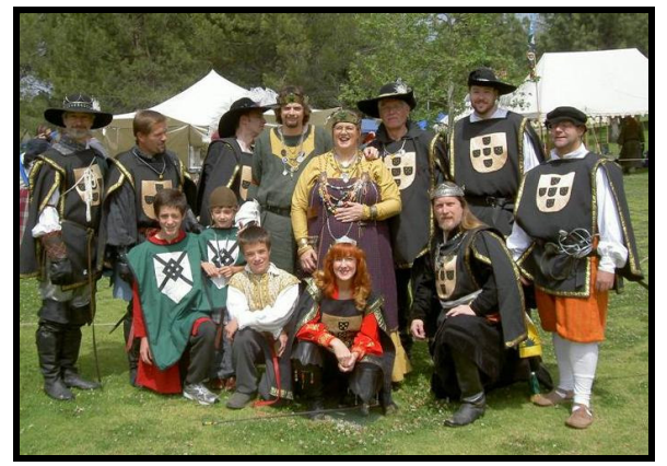
House Porthos escort the B&B