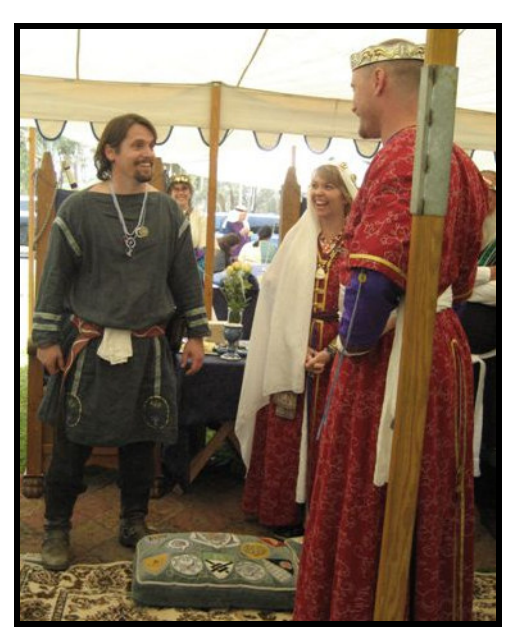
Baird is asked to join the Chivalry