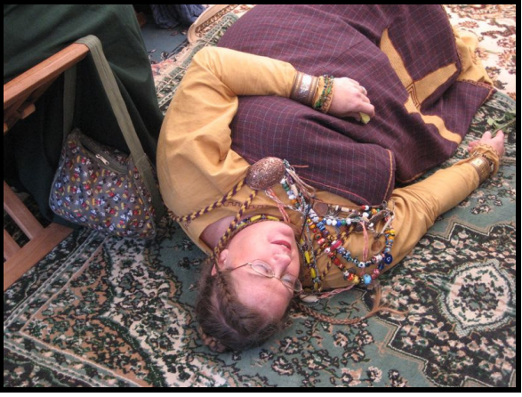
DEATH BY CHOCOLATE!!!