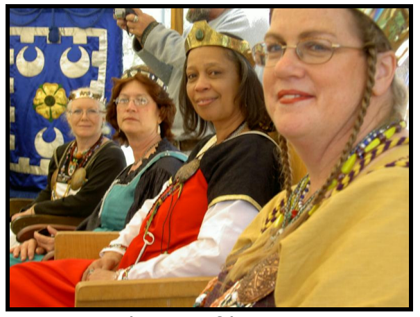
and Four of her Baronesses!!